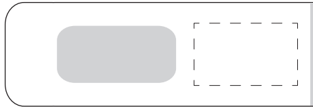
Front Print Area: 20 x 12 mm